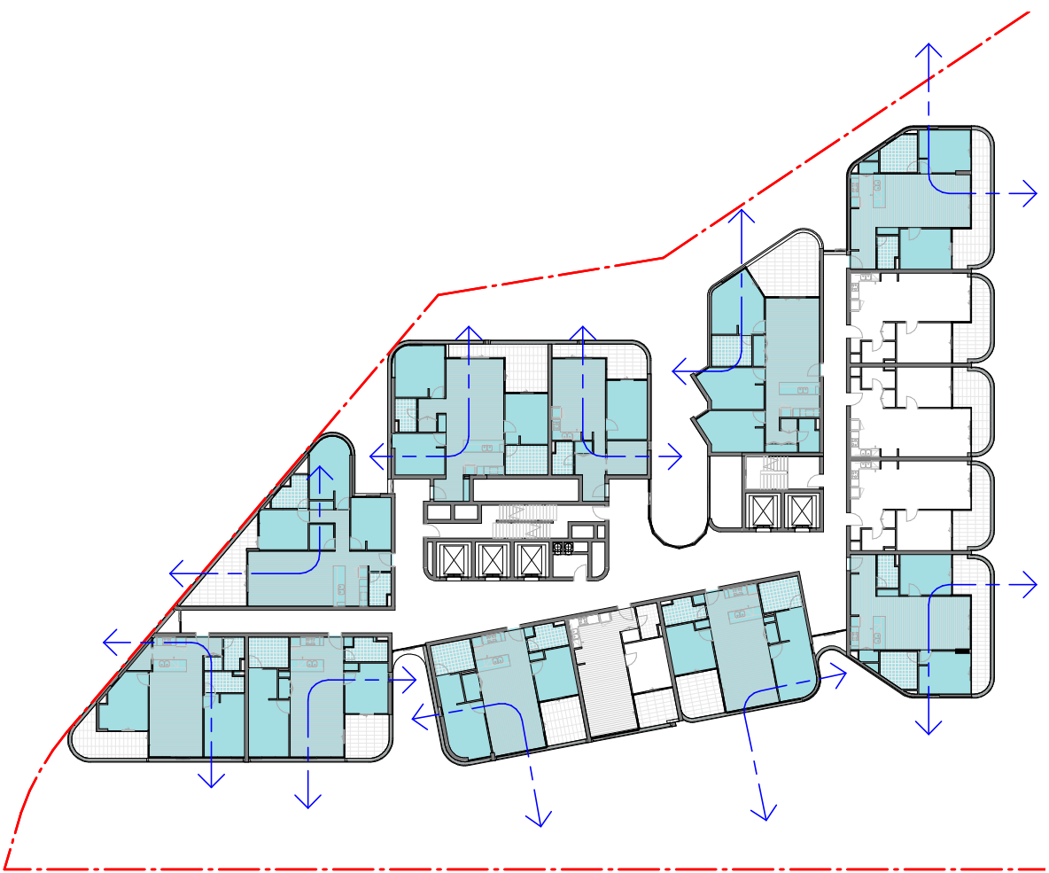
LEVEL 3 - 8